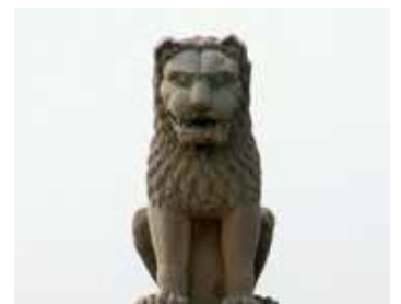
VAISHALI RELIC STUPA