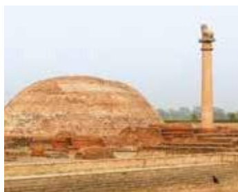
VAISHALI RELIC STUPA