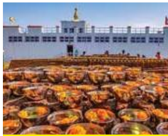
MAYA DEVI TEMPLE