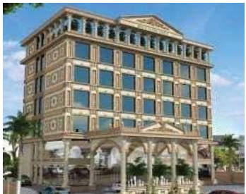
THE FERN RESIDENCY