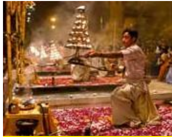
EVENING GANGA AARTI