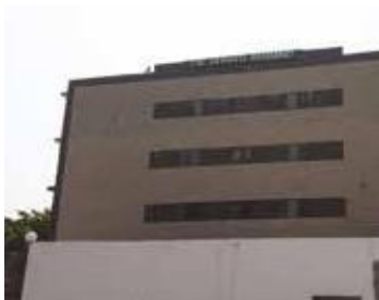
THE SRAVASTI RESIDENCY