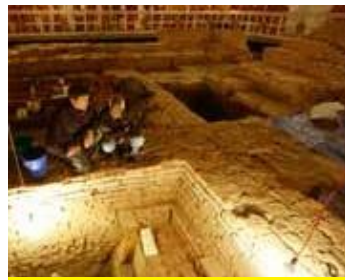
MAYA DEVI TEMPLE