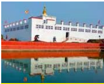
MAYA DEVI TEMPLE