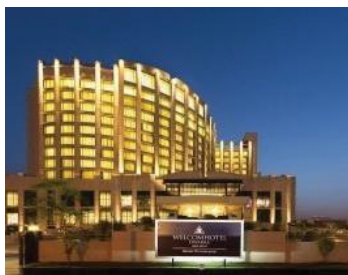
WELCOM HOTEL DWARKA