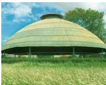
VAISHALI RELIC STUPA