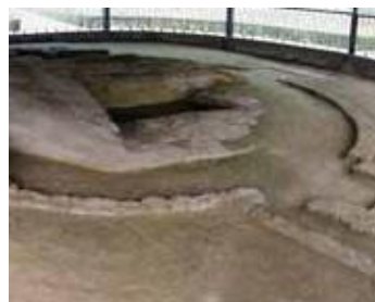
VAISHALI RELIC STUPA