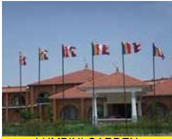
LUMBINI GARDEN NEW CRYSTAL