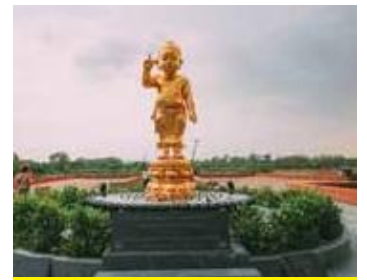
MAYA DEVI TEMPLE